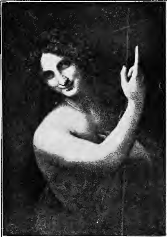
JOHN THE BAPTIST